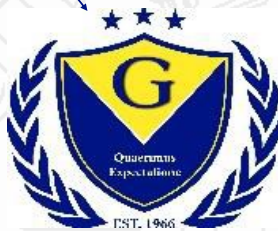
Preferred Crest Uniform Shirt